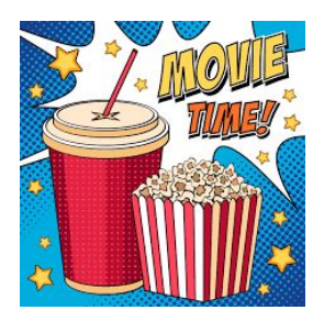
The TOP 2 grades that raise the most money will choose a movie to stream during class!